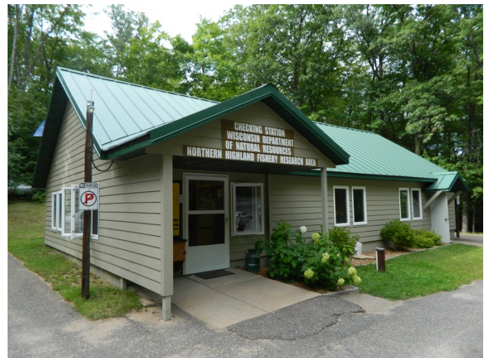
The checking station. Solar panels are located behind the building.