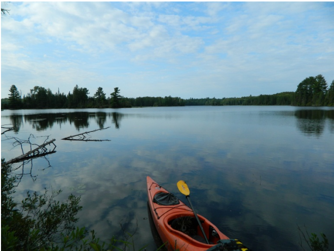
View from the bog at the south end of the main basin.