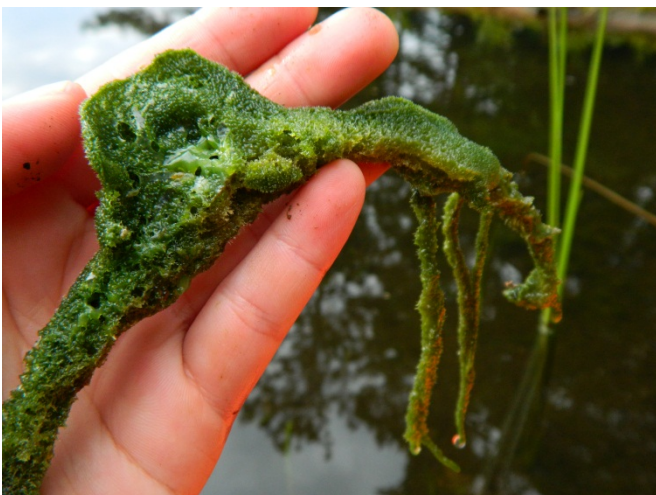
Close encounter with a freshwater sponge.