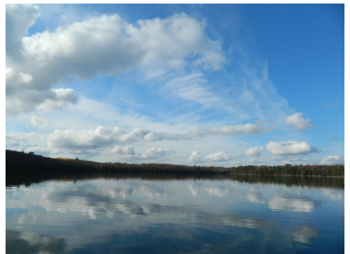
The landscape in October 2012.