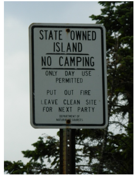
Sign on the southernmost island: government regulation at work