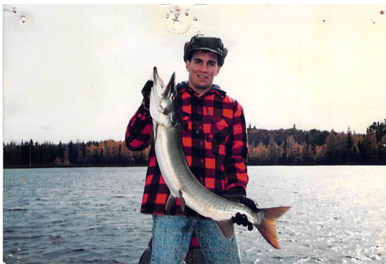
October 13th, 1991 "See you in spring!"