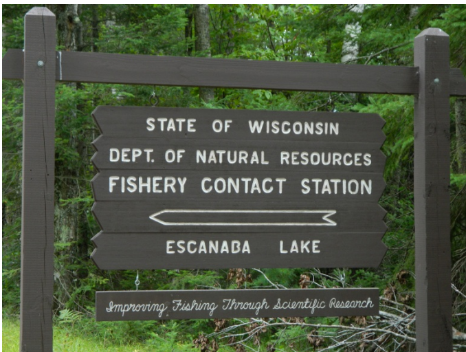
Note slogan hanging on the bottom: “Improving Fishing Through Scientific Research”