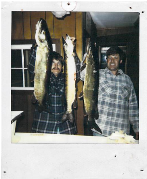
7-2-95 The Bull Bros 36"-32"-33"-28"