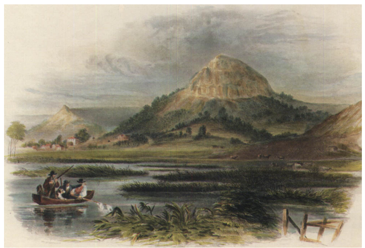
Figure 1. Wapasha's Cap, circa 1820, before it was quarried.