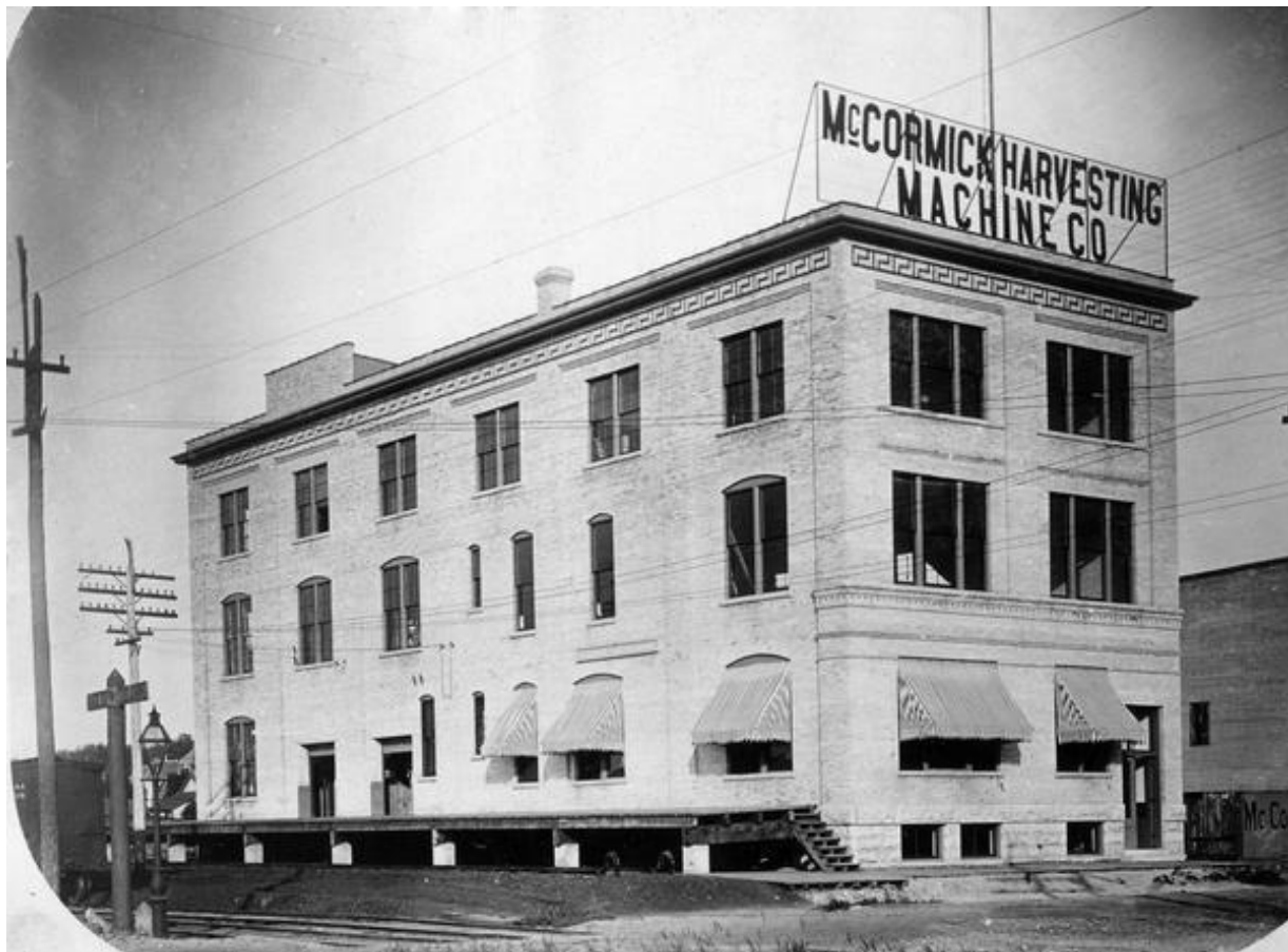
Figure 3. McCormick Harvesting Machine Company Building in 1899 19