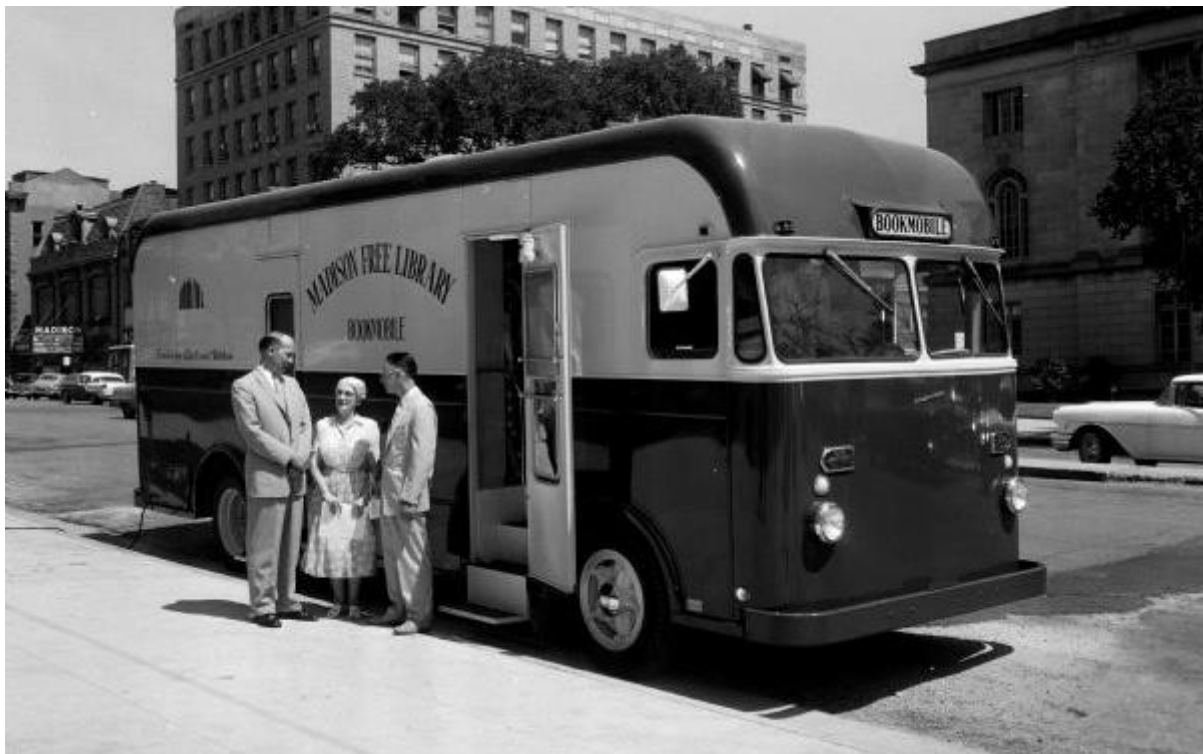
Figure 6. A library minibus brings books directly to readers. 42

improvement was hampered by challenges in material choice and cost, and the combination of both drew consternation from city residents, attacked by dust and taxes. 39 A census in 1903 recorded only ten automobiles owned in the entire city. 40 By 1918, however, sufficient progress seems to have been made that an asphalt supplier felt confident enough to pay for a full-page advertisement in several publications, proclaiming the streets of Madison were “without dust, without mud, without noise, and without big maintenance expense.” 41