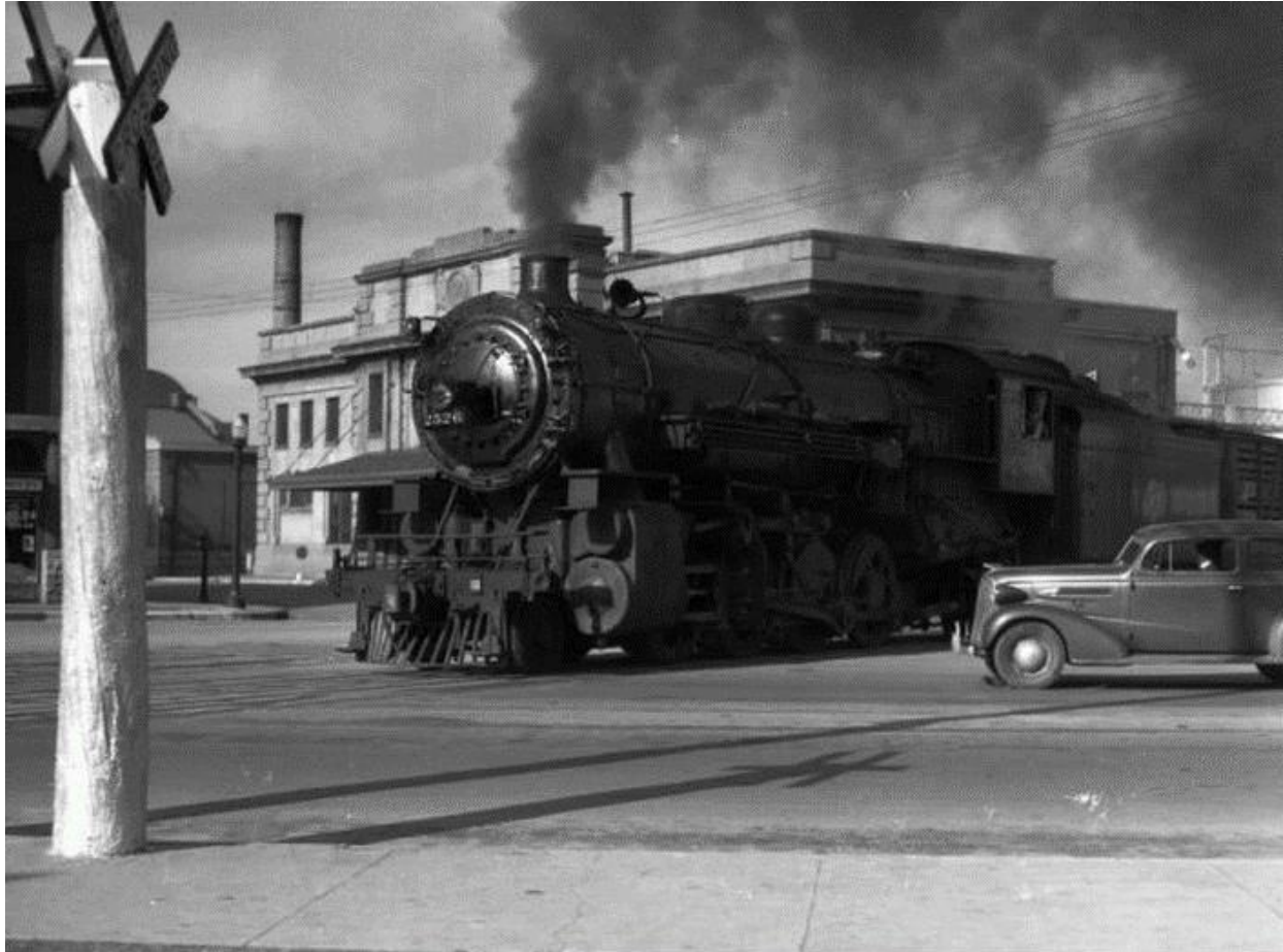
Figure 10. A close encounter between car and train in 1939 48

situations of tensions. Figure 10 demonstrates how minimally the two were separated in 1939, with no physical barriers between them.