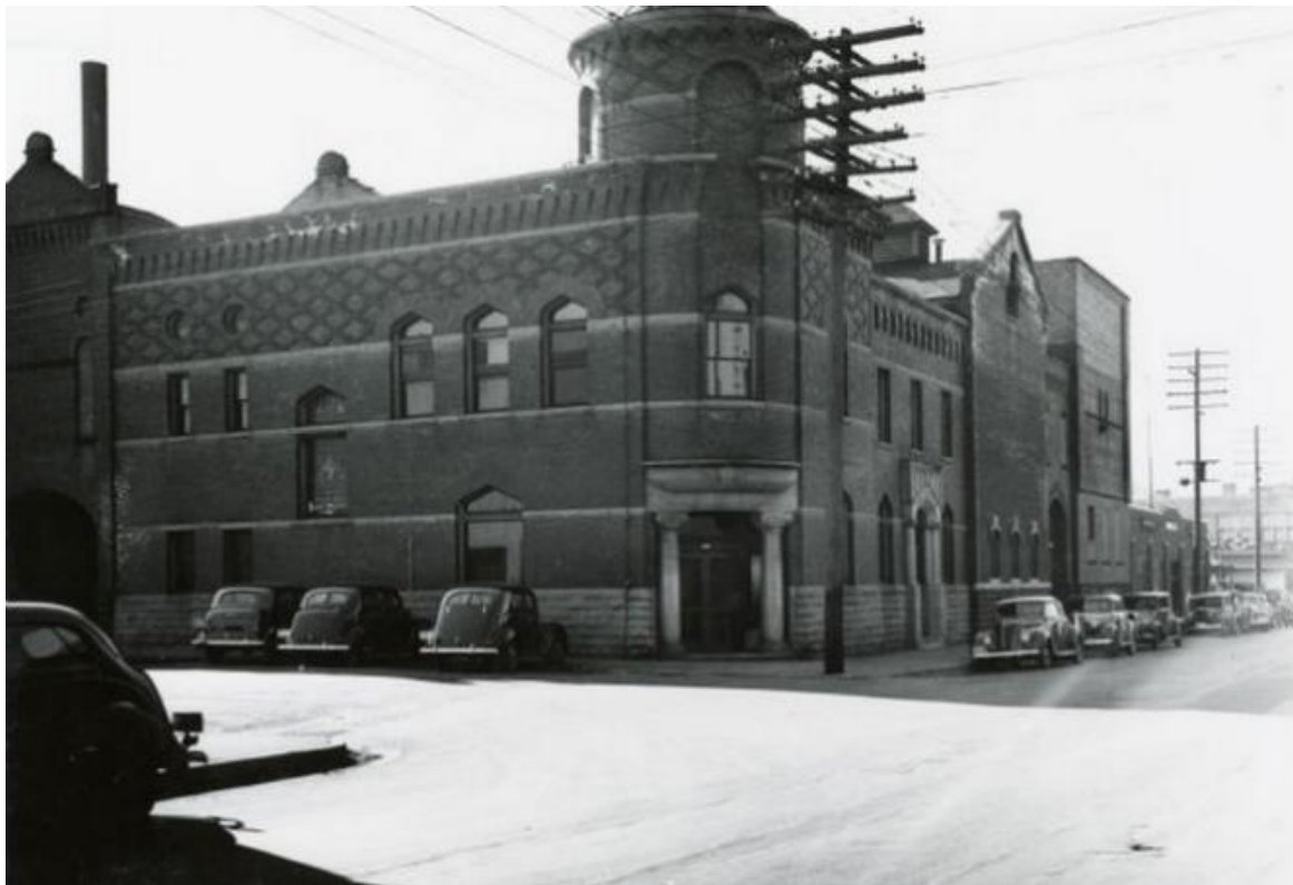
Figure 7. Fauerbach Brewery in 1939. Automobiles line Blount and Williamson Streets. 44

Photographs and records of Implement Row in the twentieth century shed light on the ways users and managers of automobiles worked with their physical environments. Drivers typically parked in an improvised if still orderly fashion, typically on the roadside or on empty plots of land (see Figure 7). Streets were paved with varying materials; Williamson Street was paved with expensive brick in 1904 while Blount Street received the same treatment only in 1911, probably because Williamson Street was more heavily used by motorists. 43