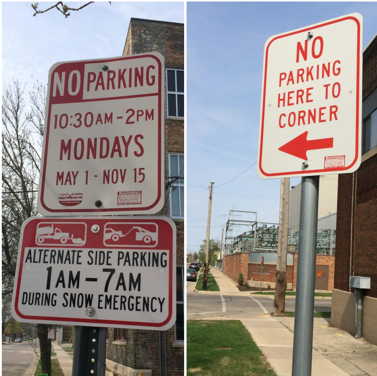
Figure 8. An array of parking regulations in Implement Row today. 45