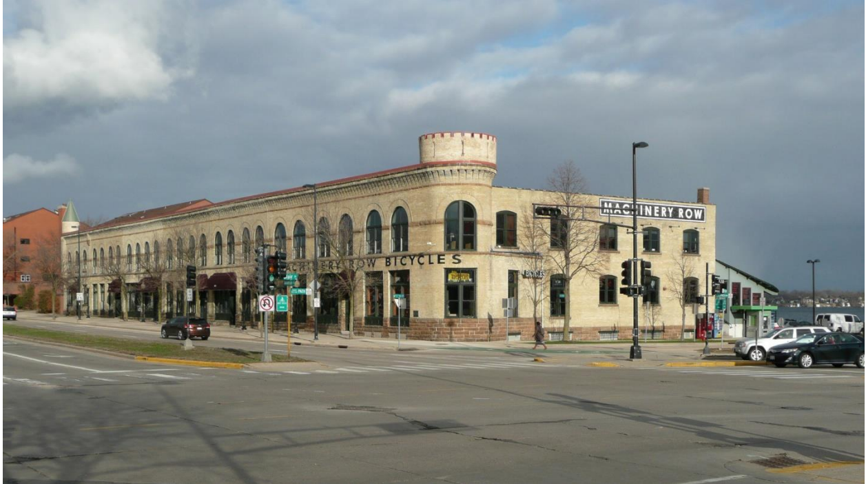
Figure 1. Machinery Row in 2013 1

Machinery Row is arguably one of the most handsome buildings in Madison, Wisconsin. Designed in a Romanesque Revival style, its beige brick structure occupies an impressive 27 lots on Williamson Street. With a tower at one end and a cone roof at the other, the building looks like a carefully extracted section of a castle. Striking black-and-white paint in a modernist typeface announces MACHINERY ROW to the thousands of motorists, cyclists, and pedestrians who pass it every day. It is a hard building to miss – if you approach from the west, following the gentle curves of Lake Monona, you will see its façade long before you are near it, for few structures exist to obstruct your view.