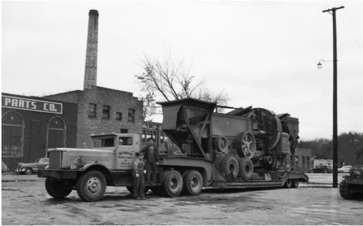
Figure 5: A Reynolds flatbed truck transporting industrial equipment. 33

To be sure, the farm implement business did not die out in Madison. For the rest of the twentieth century, the remaining implement distributors either relocated out of Implement Row to farther east or left Madison altogether. 34 Those that stayed in the city hardly congregated in any particular area, and certainly many were no longer adjacent to railroads. Several trends may explain this shift: the increasing corporatization of farms likely meant fewer farmers patronized branch houses and of those remaining, they likely had enough capital to not