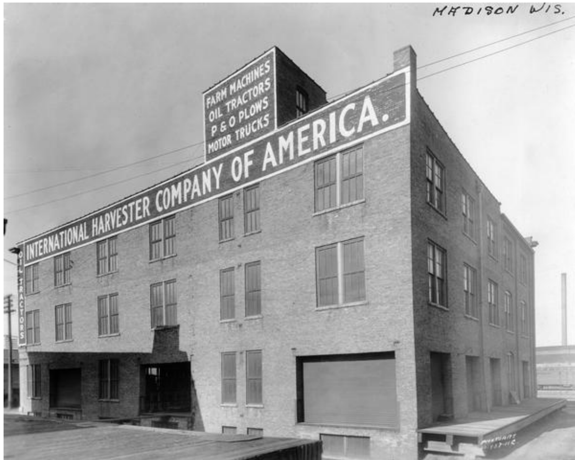
Figure 4. International Harvester Company Building in 1919 28

foreground of Figure 4). 26 The expansion program brought the building up to date with the company's latest building standards, which required branch houses to face two railroad tracks, and enabled it to serve six rail cars concurrently. 27