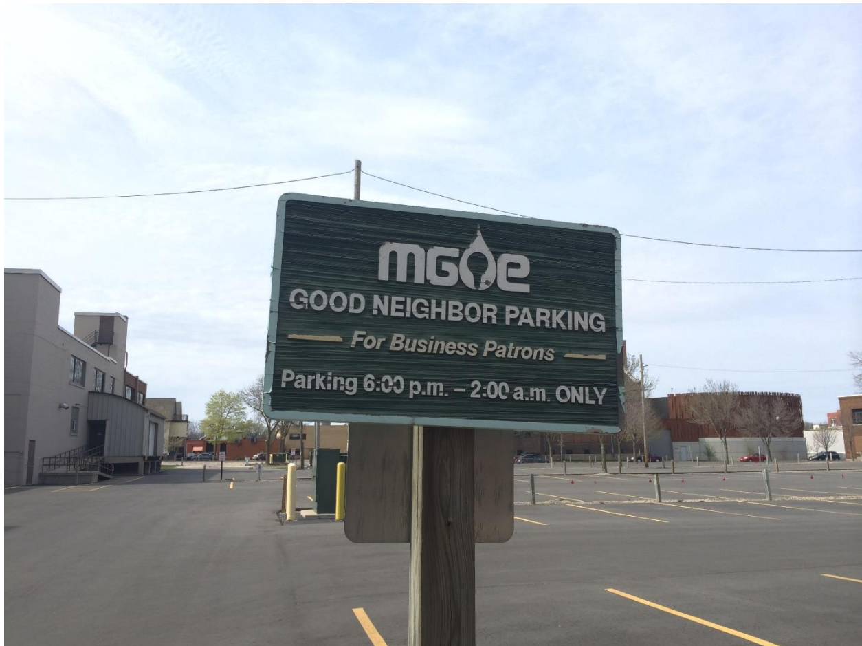
Figure 9. MG&E offers parking to its neighbors during limited hours. 46