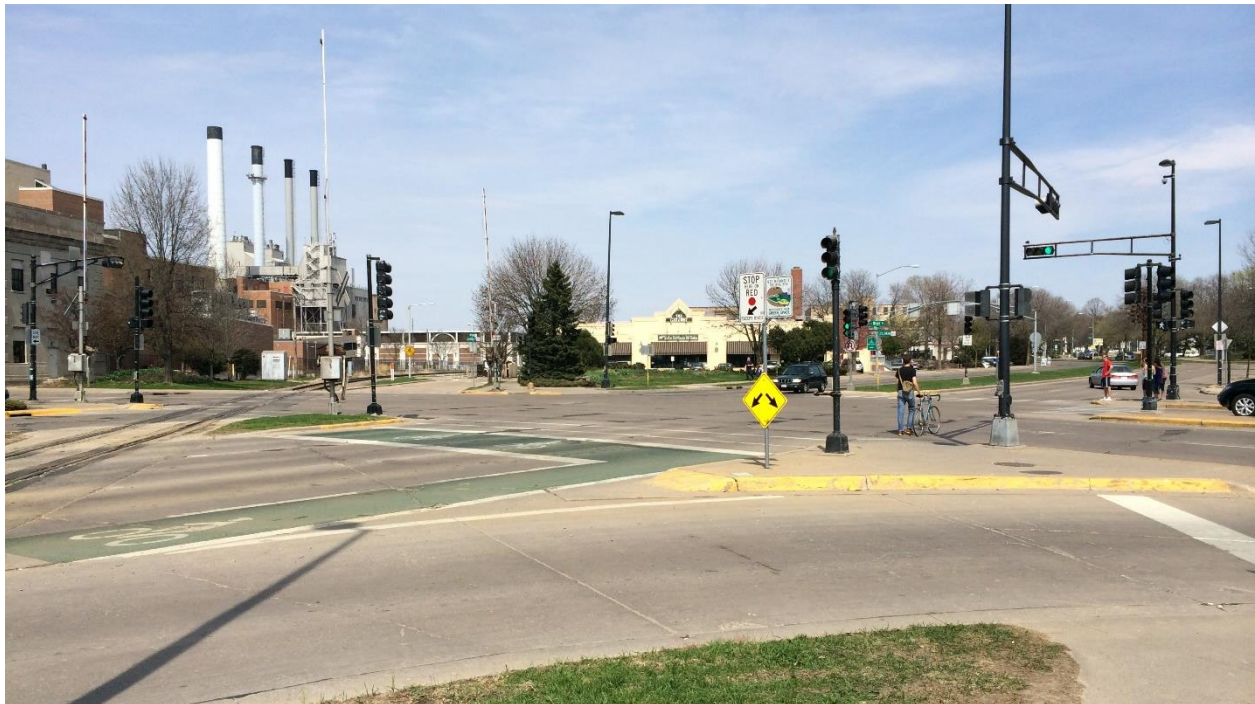
Figure 11. An intersection of pedestrians, automobiles, bicycles, and trains 51

competition: the familiar intersection of Blount Street, Williamson Street, and Wilson Street now contains automobile roads, bicycle lanes, pedestrian crossings, and railroad tracks. Where it once founded its reputation on the power of one technology, it now finds itself at the intersection of four (see Figure 11). On Implement Row, imbricated layers of history form a rich, occasionally chaotic environment. 50